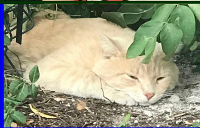
Be on the lookout for CHAMP the Cat who has taken up residence in our parking lot.